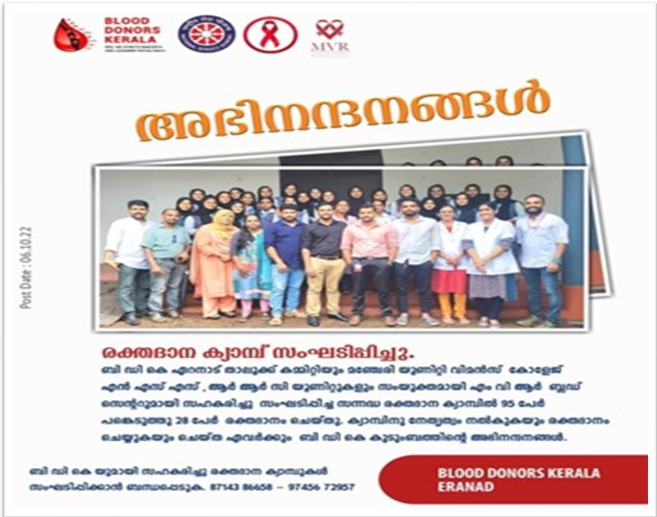
Figure 2-Appreciation for blood donation camp

A certificate of appreciation was given to KAHM unity women's college, Manjeri for conducting the blood donation camp collaboration with blood donors Kerala.