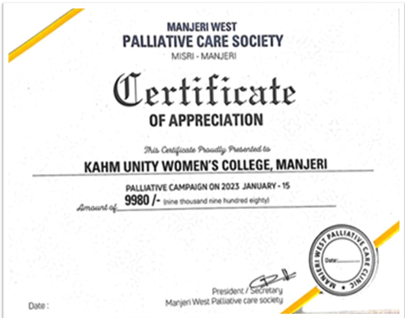
Figure 3- Certificate of appreciation for Fund collection

A certificate of appreciation was given to KAHM Unity women's college ,Manjeri by Manjeri west Palliative care society for the fund colleted by the students as charity contribution.